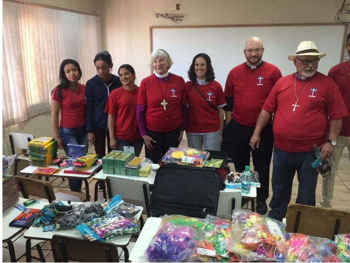
.The Diocese of Indianapolis (and especially St. David's!) donated school supplies and toys to the children in Brasilia.