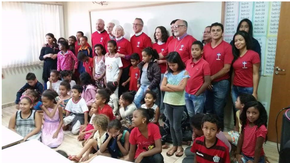
Social Center in Pedragal, Brazil with missionaries from Diocese of Indianapolis.

Also, please share this with your friends so we can get the word out!