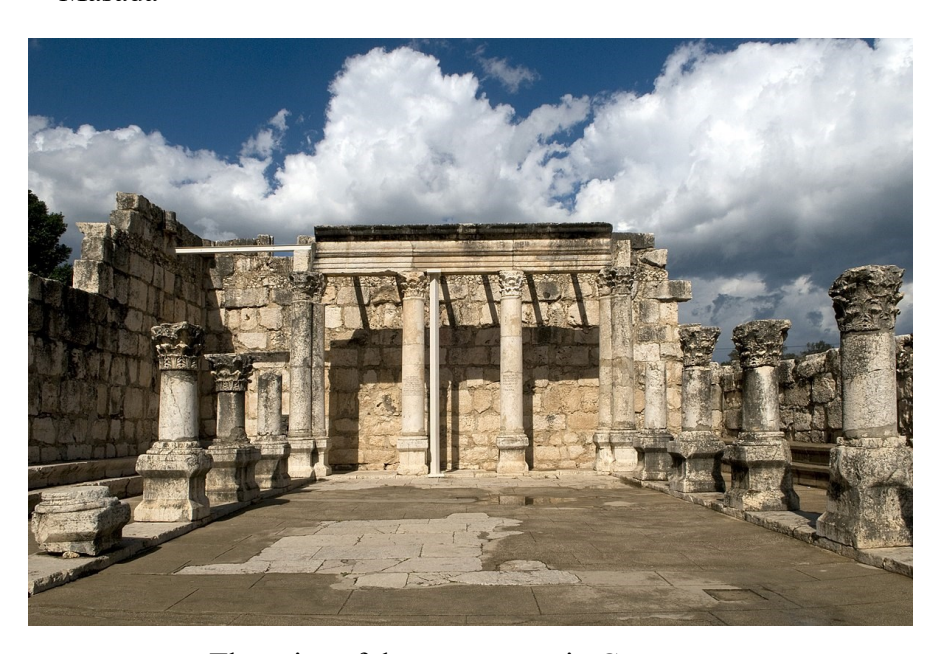
The ruins of the synagogue in Capernaum